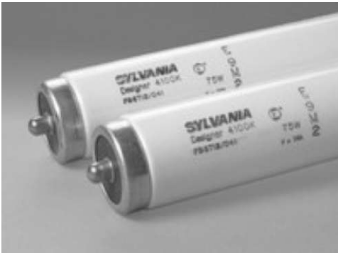
Standard lamps CWHO T-12 pin types

Replace both the face and the retainer. Screw retainer back into position.